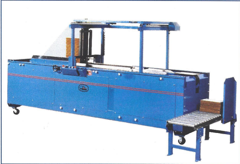
Model 2480 shown with options.

The perfect off-line solution for transporting flat corrugated cases and die cuts sheets. Reduces inventory when used with a label applicator, Ink jet and RFID'S.